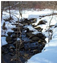
Beaver Dam Creek