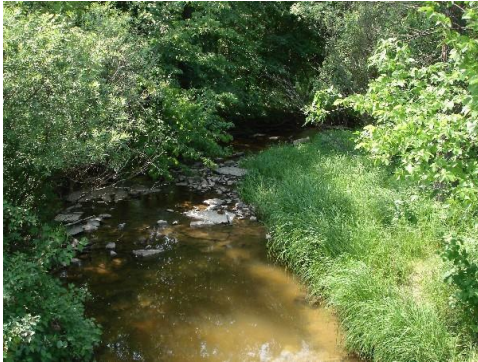
Baird Creek Parkway

A Greenway also known as Parkway, Conservancy or Environmental Sensitive Area, is an area of natural vegetation next to a waterway managed and protected for the benefit of the Community and Environment. Greenways are very beneficial to the reduction of storm water runoff, flood reduction, water quality protection, and preservation of biological diversity.