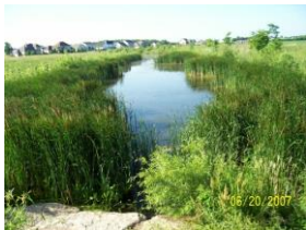
Barina Creek Conservancy

Baird Creek Parkway, Barina Creek Conservancy, Beaver Dam Creek Parkway, Duck Creek Parkway, Ellis Creek South Branch Parkway, LaCount Parkway, Mahon Creek Parkway, Newberry Conservancy, Nicholson Creek, and Willow Creek Parkway.